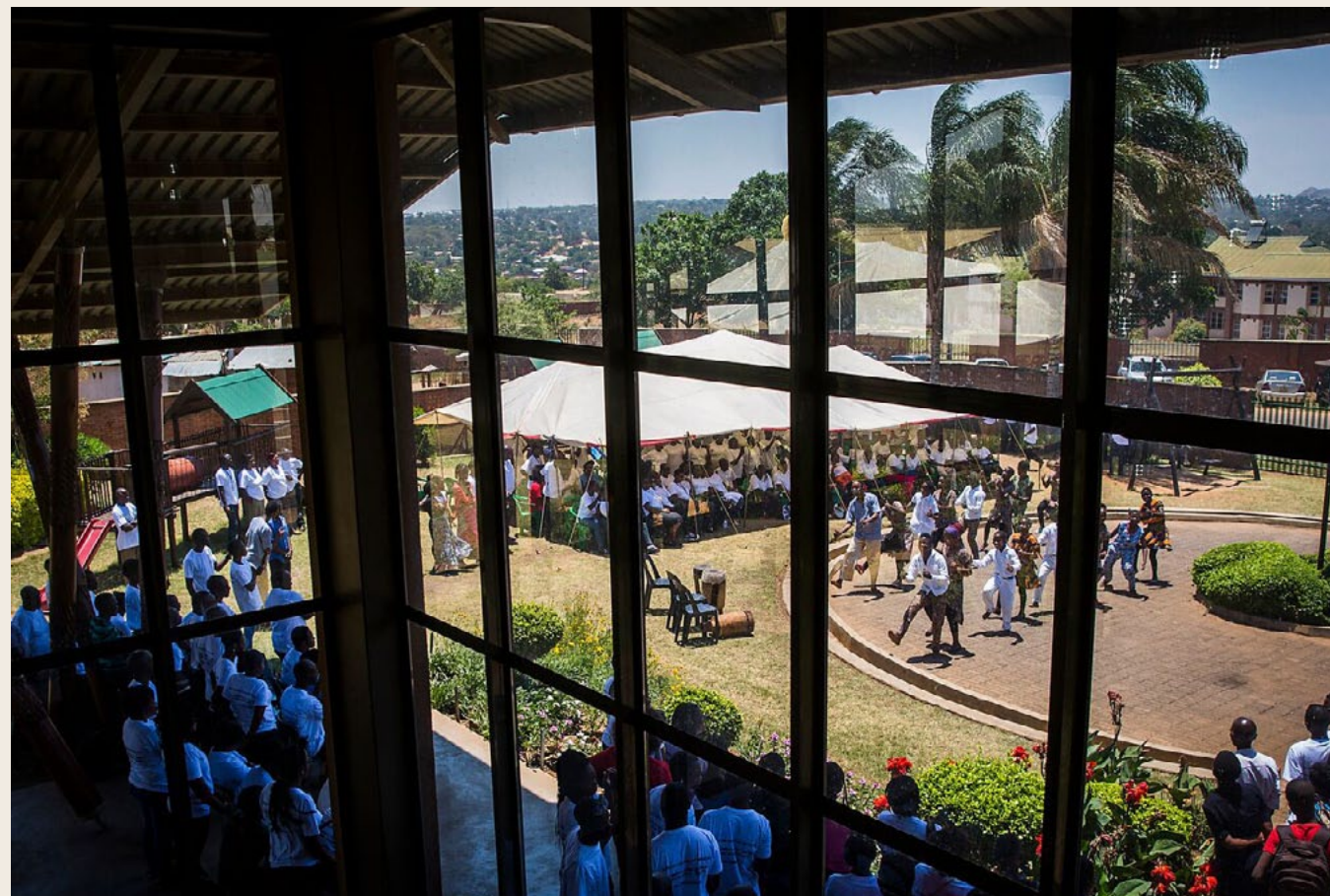
Traditional dancers perform at the 10th Anniversary Celebration for the Baylor College of Medicine-Abbott Fund Children's Clinical Center of Excellence at Kamuzu Central Hospital in Lilongwe, Malawi.