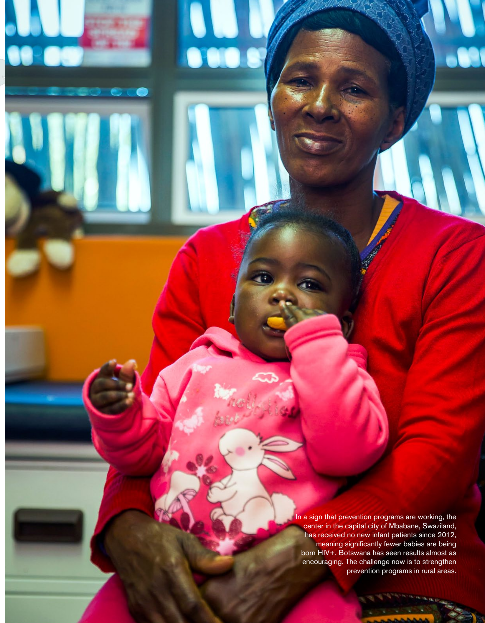
In a sign that prevention programs are working, the center in the capital city of Mbabane, Swaziland, has received no new infant patients since 2012, meaning significantly fewer babies are being born HIV+. Botswana has seen results almost as encouraging. The challenge now is to strengthen prevention programs in rural areas.