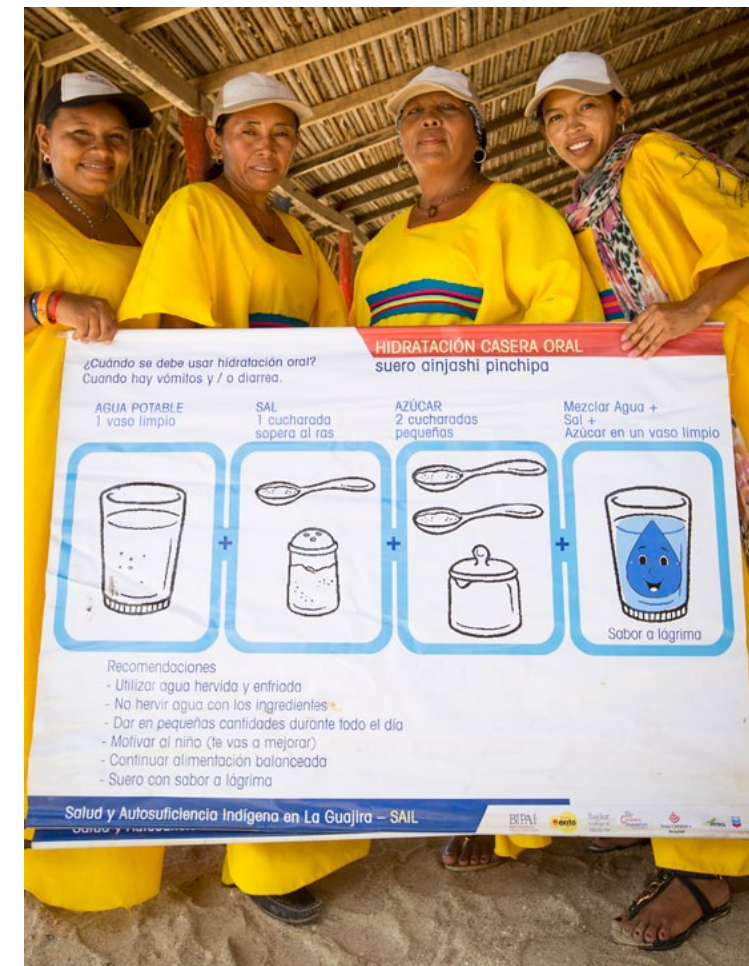
Community health workers in the Health and Indigenous Self-Sufficiency in La Guajira program known as SAIL help reduce childhood malnutrition and maternal mortality in the indigenous population of La Guajira, Colombia.

Community education also figures prominently into BIPAI's efforts, with its Centers of Excellence hosting testing days, and its workers attending community festivals to discourage stigma and offer public education.