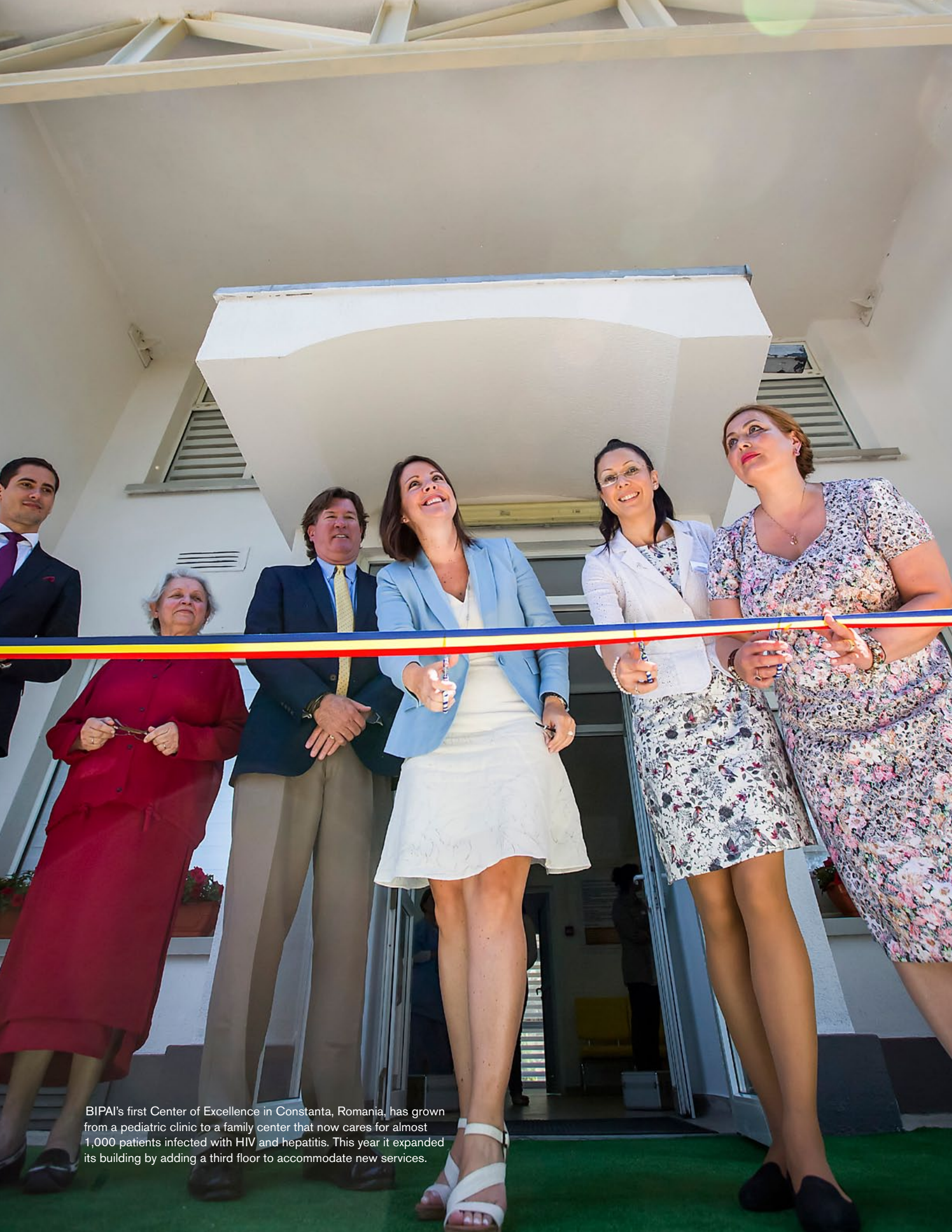
BIPAI's first Center of Excellence in Constanta, Romania, has grown from a pediatric clinic to a family center that now cares for almost 1,000 patients infected with HIV and hepatitis. This year it expanded its building by adding a third floor to accommodate new services.