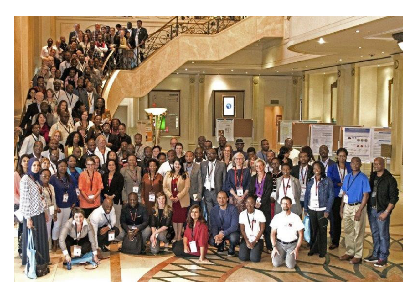
Above: Delegates from 27 countries attended the H3 Africa Consortium Meeting held in Gaborone, Botswana hosted by Botswana-Baylor.

The COE also addresses the needs of caregivers with complex social situations through the Family Model Clinic (FMC). The FMC operates within the COE and serves the primary care needs of many of the HIV-infected adult caregivers of children and adolescents enrolled in treatment at Botswana-Baylor. The FMC also cares for a group of young adult patients who have transitioned from the PIDC. The FMC is staffed by an adult physician or medical officers on a rotational basis with a typical