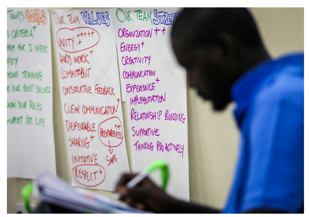
Training at the Botswana-Baylor COE.