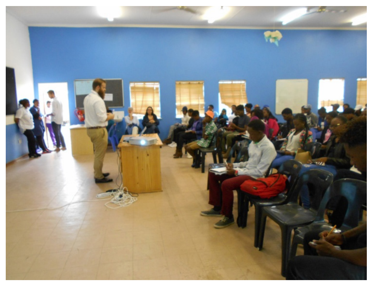
FTLW program attends a Ready to Work workshop session learning about people, money, entrepreneurship and employability skills.

Airstrip, Moshupa, Ramotswa, Mochudi, and Kanye. Active Teen Club attendance stood just below 500 across the 13 sites in the past year. The programmes that Teen Club offers would not be possible without the continuous help and facilitation by Teen Leaders and over 100 adult volunteers who regularly participate in each monthly Teen Club event.