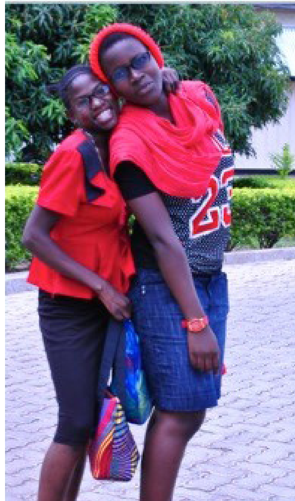
Stitch by Stitch imparts important life skills to youth in a safe environment.

teach them practical skills like sewing and beading and provide them a work space, so that they can produce income-generating craft projects. Then, we help them learn to save with Benki Yetu ("Our Bank"), an informal, peer-led savings programme that teaches adolescents important life and financial health skills.