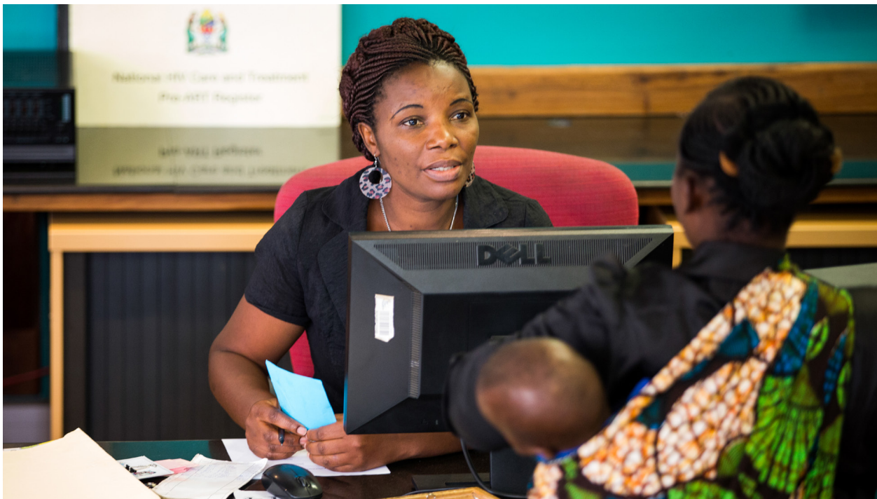
A mother receives a consultation at the Baylor COE.

involved in developing and revising national paediatric and adolescent HIV and TB care guidelines. Our pharmacy staff works diligently within the local drug procurement apparatus to advocate for uninterrupted access to paediatric-friendly drug formulations, so our patients never miss doses due to drug shortages. Finally, we partner with the US Peace Corps and Princeton in Africa to bring us high-quality technical support in the areas of strategic program development and execution; thus we ensure that we are always strengthening our own implementation practices, and serving as a model of excellence in paediatric care.