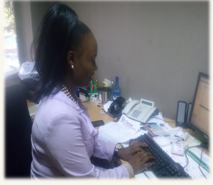
Executive Secretary at work