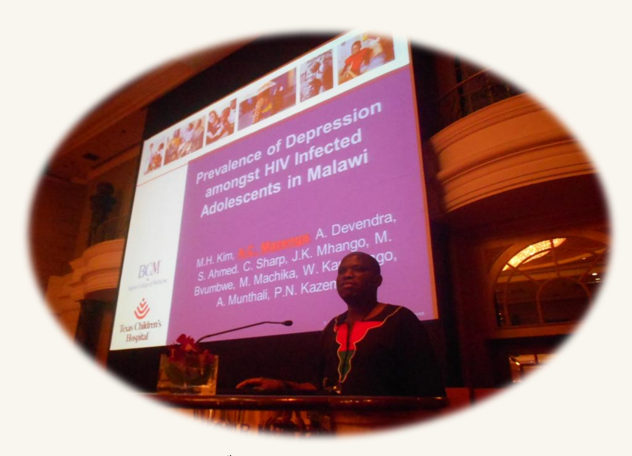
BIPAI presents at the 5<sup>th</sup> International Workshop on HIV Paediatrics in Kuala Lumpur, Malaysia