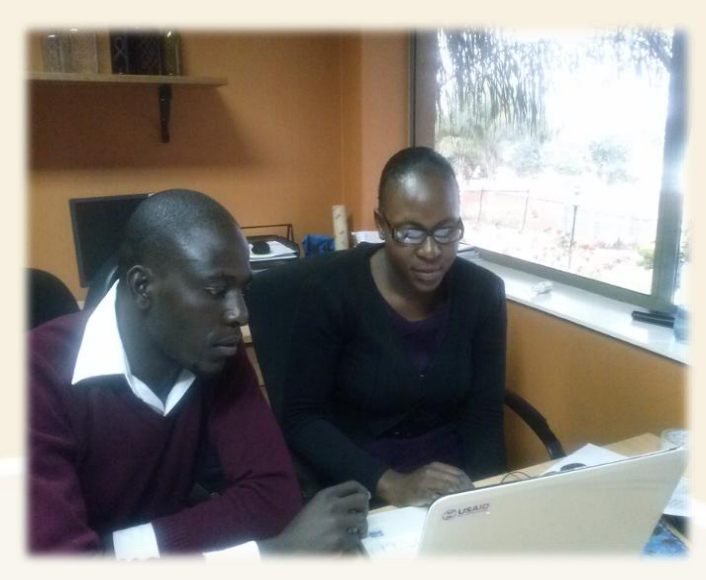
Monitoring and Evaluation Staff at Work

Lost-to-follow-up and defaulter tracking and have had good success bringing patients back to care. Our psychosocial counselor has started small group counseling sessions for families whose kids have persistent poor adherence and complex social situations.