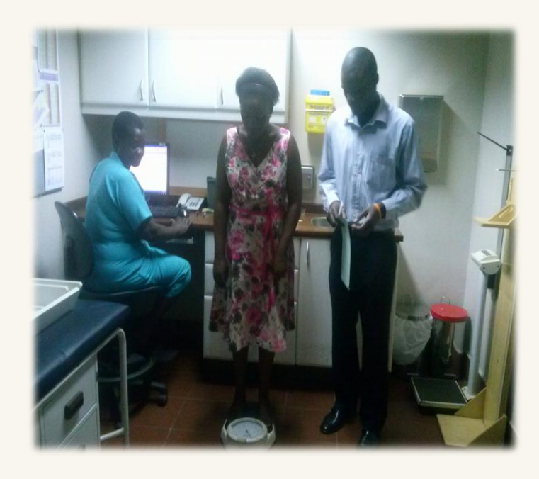
Triage in progress

Baylor Malawi has remained focused on PMTCT through direct clinical care and outreach. Direct referrals for breastfeeding mothers to start ART are made from our clinic. We also offer family planning options to women in the clinic. Through mentorship, we emphasize integrated mother-infant care and health center systems strengthening in line with the Ministry of Health's ART/PMTCT