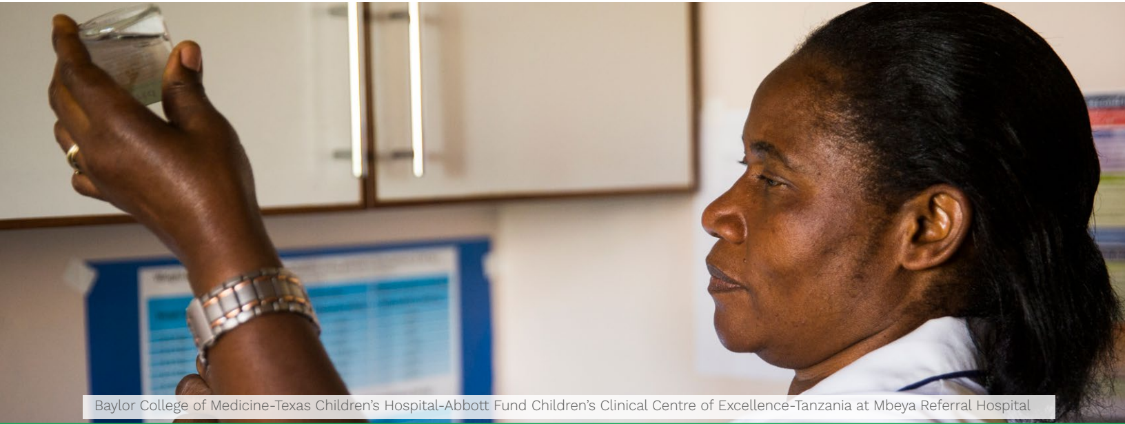
Baylor College of Medicine-Texas Children's Hospital-Abbott Fund Children's Clinical Centre of Excellence-Tanzania at Mbeya Referral Hospital

Baylor-Tanzania offers a comprehensive array of preventive services for HIV, TB, malnutrition, and common childhood and adolescent illnesses.