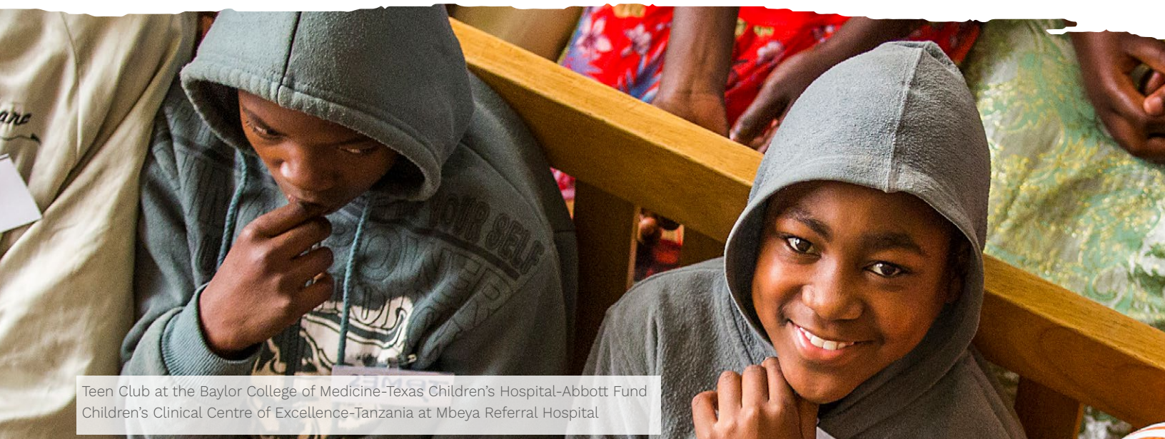
Teen Club at the Baylor College of Medicine-Texas Children's Hospital-Abbott Fund Children's Clinical Centre of Excellence-Tanzania at Mbeya Referral Hospital