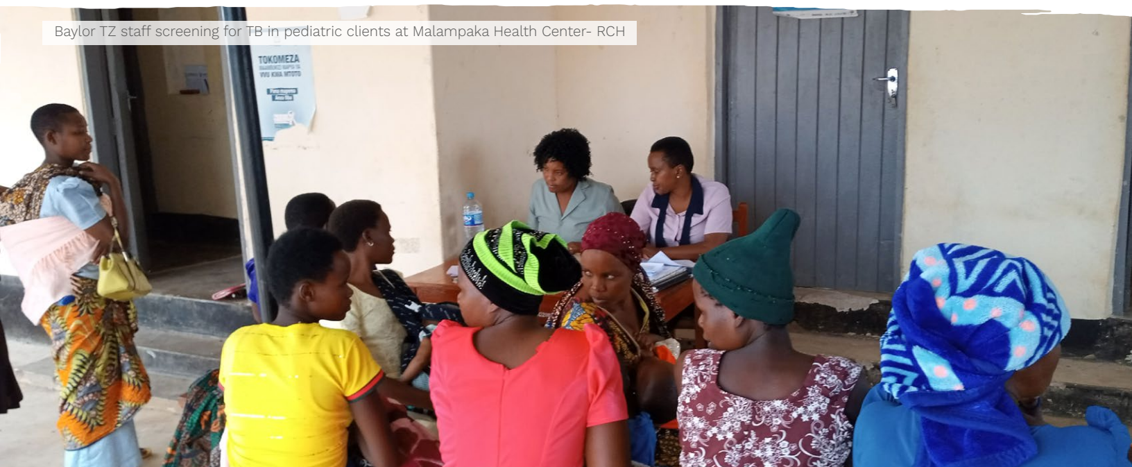
Baylor TZ staff screening for TB in pediatric clients at Malampaka Health Center- RCH