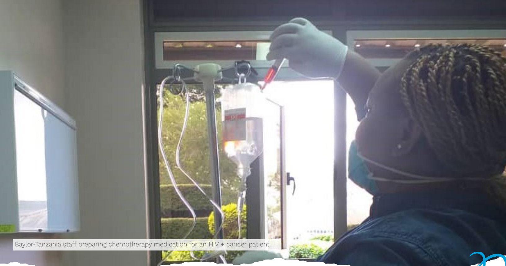
Baylor-Tanzania staff preparing chemotherapy medication for an HIV + cancer patient