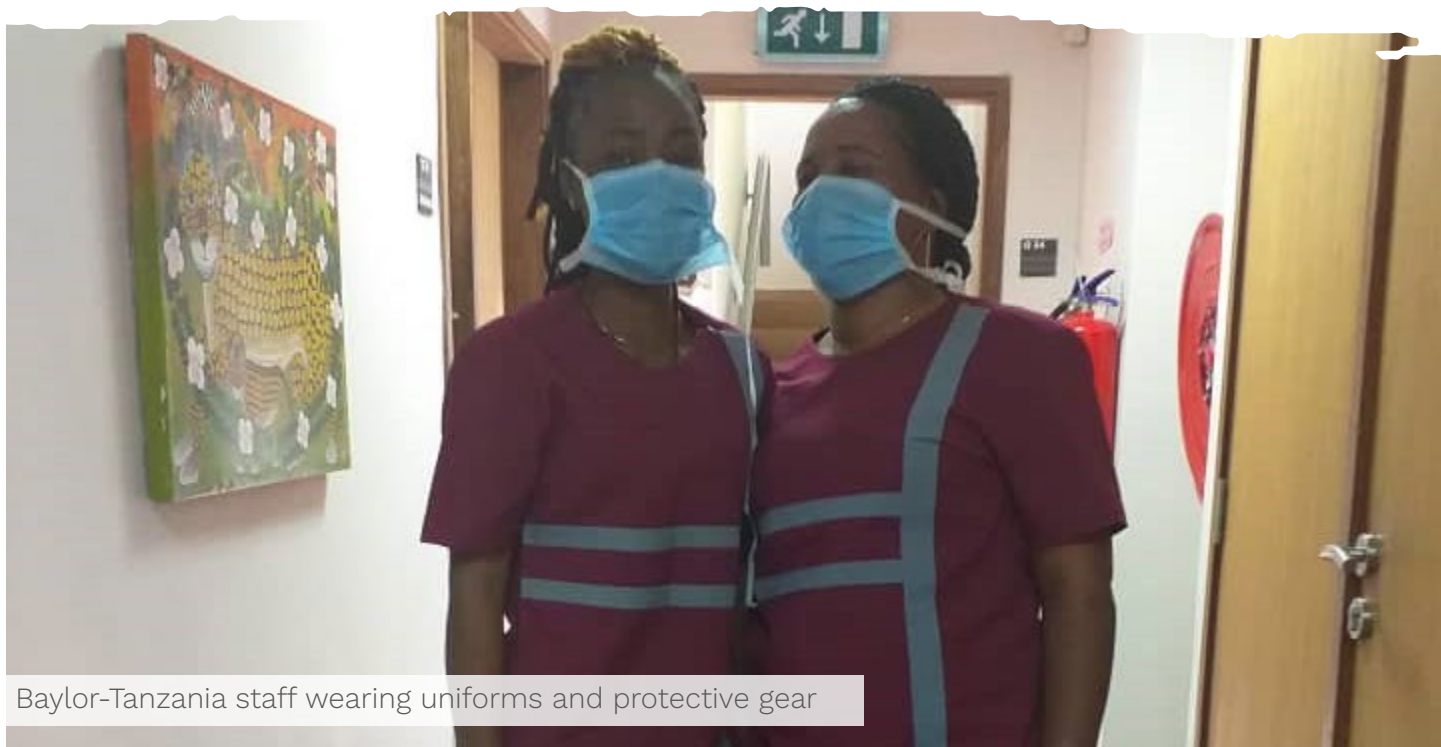
Baylor-Tanzania staff wearing uniforms and protective gear

Despite the unprecedented difficulty of the COVID-19 pandemic, Baylor-Tanzania staff and patients were able to successfully adapt to the new challenges. Specifically, Baylor-Tanzania's staff and patients' unique experiences addressing the HIV/AIDS epidemic gave them the resilience and resourcefulness they needed to find solutions to the new problems posed by the COVID-19 pandemic. And Baylor-Tanzania's organizational flexibility allowed the program to rapidly make changes to keep staff and patients safe. As the COVID-19 pandemic continues to develop, Baylor-Tanzania will utilize their personal and organizational skills to keep addressing the new challenges in the months and years ahead.