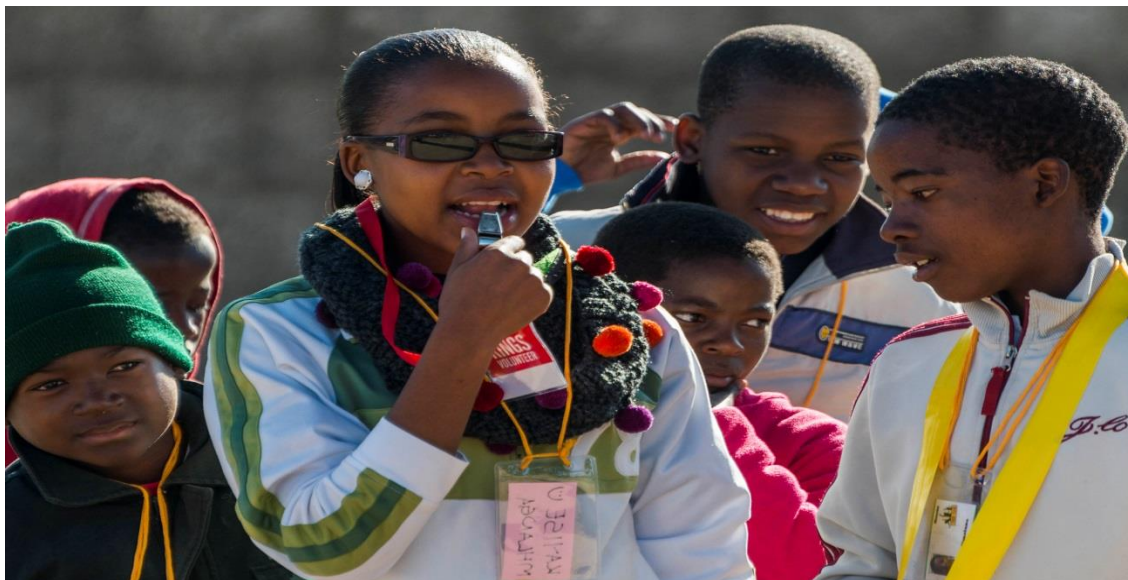
Teen club session

Baylor Swaziland also builds teen leadership capacity to support knowledge growth and leadership. This is done through semi-annual teen leadership training and encouraging peer leadership at Teen Club activities. By the end of the year, 91 teens were trained in leadership skills and 178 teens helped facilitate lessons during monthly Teen Club meetings. Some of these, however, are duplicate teens that help at more than one Teen Club.