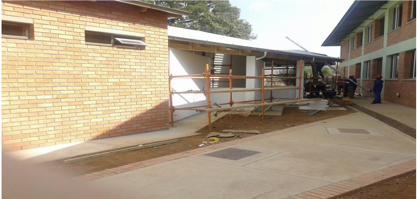
Construction of the new national referral paediatric TB clinic