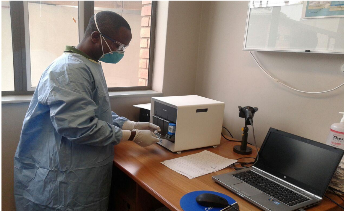
Laboratory section of the clinic

Baylor Swaziland has continued strengthening and monitoring the laboratory activities as a measure to carry out its quality assurance requirement. The centre's laboratory is enrolled with the National Health Laboratory Services (NHLS) which provides external quality assurance in tests for both HIV and TB diagnosis.