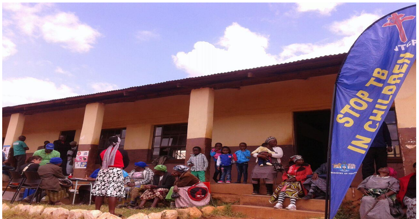
TB Outreach Activities